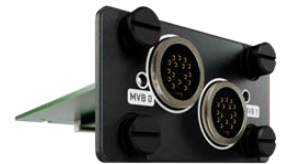
MVB serial interface