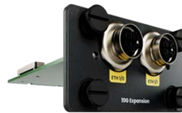
10 GbE interface