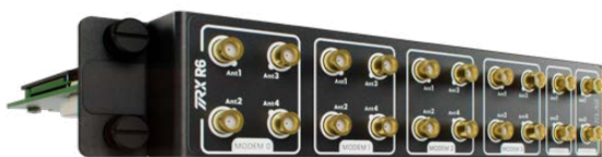
Multi-modem carrier (supports up to six 4G modems)

A range of expansion boards are as follows: